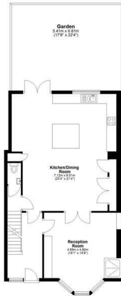
Ground Floor Approx. 79.4 sq. metres (854.7 sq. feet)